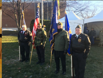
Clockwise from top: Thanksgiving Day Race starting on Main Street. Map of the 4.748-mile course. Saturday morning Sports Expo. Veterans' Row on Race Day. Blood Drive held on Friday after the Race. Press conference preceding the Race. Map of CT showing Town location. In center: the Little Manchester Road Race, which has grown to 1,000 runners!